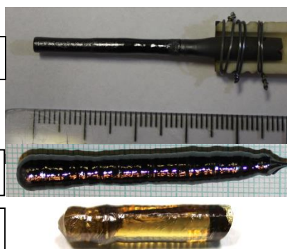
Examples of prepared materials.